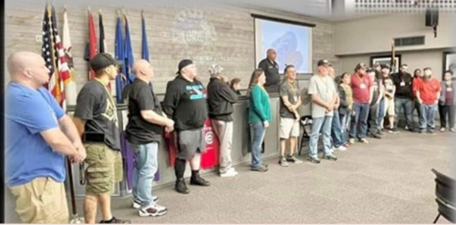
First Timers! (Newbies)